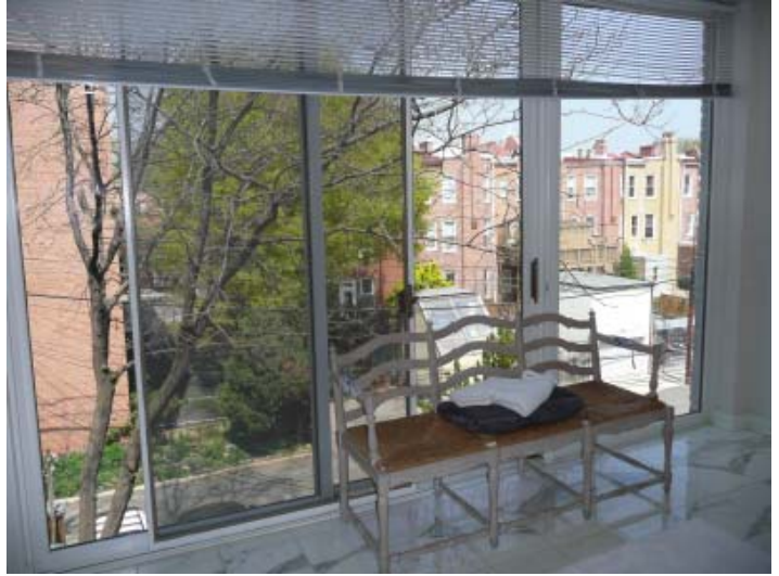
PART OF WALK-IN CLOSET