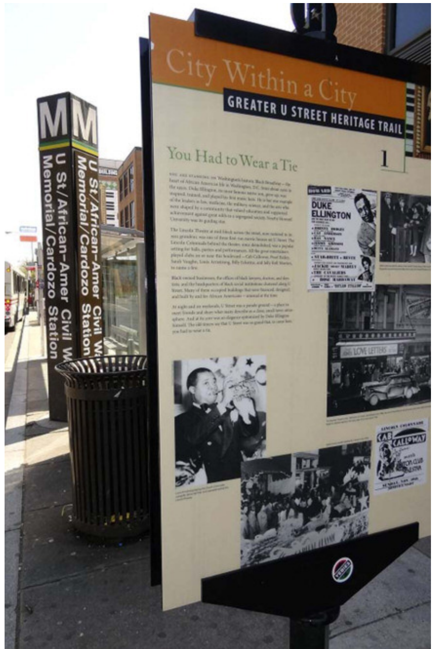
Metro and Historic Neighborhood

TRANSPORTATION – Zipcar, Capital Bikeshare, U Street metro, various bus/Circulator lines all within 0.14 miles.