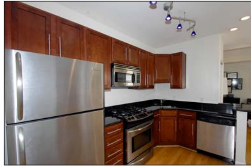
Granite and Stainless Kitchen