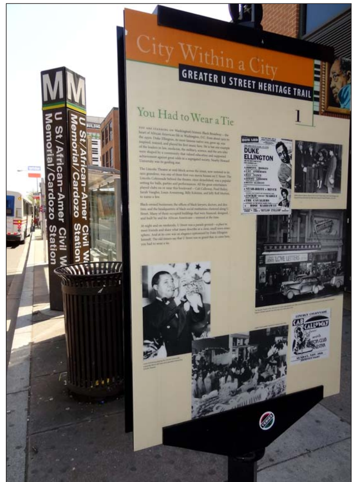
Metro - just 2 blocks away!