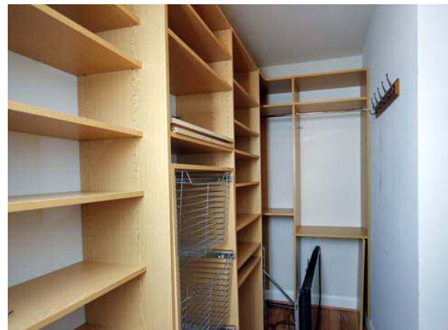
One of many large closets